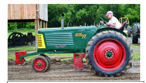
Neither men nor women drivers were intimidated by the weather at the tractor pull