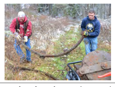
Museum board members retrieve a variety of pieces of equipment near Bradford