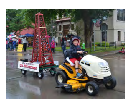
It was difficult to keep dry on parade day.