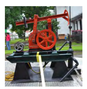
One of the pieces of oil field equipment on display on parade day