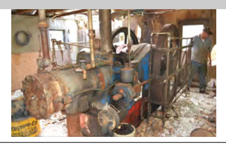
Checking out an old engine that powered a bandwheel power on the Vosburg Lease